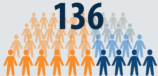
Counseling/advising family participants

Families participated the most in our counseling/advising services, with 133 families, or 65%, receiving one-on-one support!